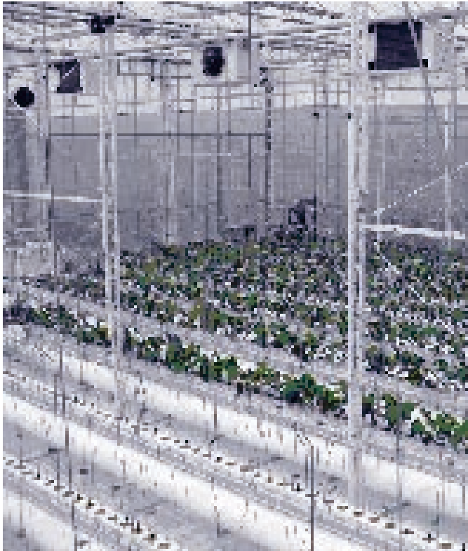
The Synergy Greenhouse in Bleiswijk: a completely closed greenhouse.

system have been compared with that of the traditional greenhouse operated using a pad and fan. The investment and operational costs have been estimated for both systems in the climate of the Gulf Region. Figure 1 shows the gross income per square meter of greenhouse as a function of tomato price. The lines represent values for the current pad and fan system and a closed greenhouse using different ways to raise CO 2 levels. CO 2 enrichment can be done by burning natural gas or by dosing pure CO 2 . Burning natural gas for CO 2 is more economical than applying pure CO 2 . The production of CO 2 by burning natural gas can be combined with production of electricity using cogeneration.