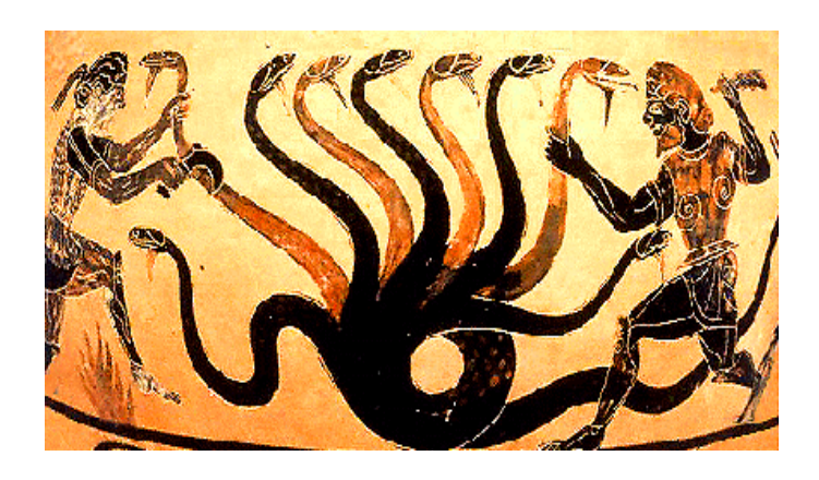
Fig. 1.1: The logo of HERACLES network

HERACLES ( Human Health and Ecological Risk Assessment for Contaminated Land in EU Member States , see Fig. 1.1 for the logo of HERACLES network) is an international long-term Research framework established by the European Commission Joint Research Centre (JRC). The purpose of HERACLES is "the improvement of the consistency of Risk assessment tools for human health and ecological risk-based soil quality assessment in the EU Member States". HERACLES focuses on both human health and ecological Risk assessment tools.