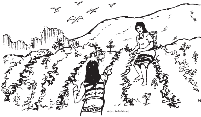
Sweet potato vines start to cover the field