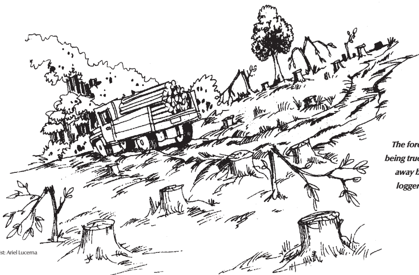
The forest being trucked away by loggers