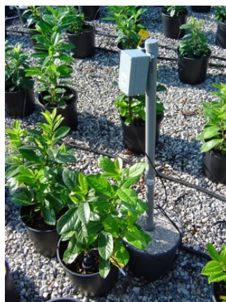
Fig. 2. A wireless sensor node with a soil moisture sensor (SM200) operated in a 5 months experiment at Centre Sperimentale Viterbo in Pistoia (Italy).