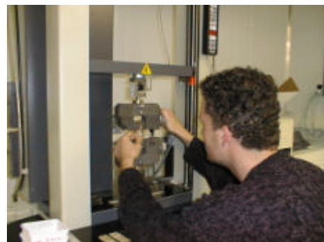
Tensile testing for plywood application