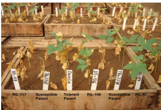
Fig. 3 Cowpea seedlings survival after 4 weeks of drought followed by 2 weeks of daily re-watering. The drought tolerant parent Dan Ila and RIL-106 had a 60% survival rate, susceptible parent TVu 7778 and RIL-117 had 0% survival, while RIL-87 had a 100% survival rate

Singh et al. (1999a) suggested that different cowpea plant organs (leaf, shoot and root) should be used to screen for drought tolerance. The authors argued that different tissues have different responses to abiotic stress and should therefore be studied individually. This may enable the identification of tissue-specific genetic factors underlying the drought responses and the elucidation of parts of the drought response pathways possibly making breeding for drought tolerance easier. A simple screening method using the “wooden box technique” (Fig. 3) has been found suitable for identifying seedling drought tolerance in cowpea. This method eliminates the influences of the root system on drought tolerance, and permits non-destructive visual identification of shoot dehydration tolerance (Singh et al. 1999a). The method has proven to be efficient in screening for drought tolerance in different crop species (Singh et al. 1999b; Tomar and Kumar 2004; Slabbert et al. 2004; Ewansiha and Singh 2006). Field and pot testing of the plants of the different crop species demonstrated a close correspondence between drought tolerance in the seedling stage and reproductive stage. The wooden box screening method has been used to identify cowpea genotypes with contrasting responses to drought (Dan Ila, IT96D-602 and TVu 11986 which exhibit seedling drought tolerance and TVu 7778 which is susceptible). The