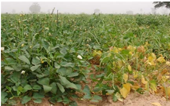
Fig. 2 Field screening of cowpea lines for drought tolerance. The plants on the left are IT98 K-205-8 (drought tolerant) and those on the right are, IT98 K-555-1 (drought susceptible)

Success in breeding for drought tolerance in cowpea has not been as pronounced as for many other traits (Singh et al. 1997). This is partly due to the lack of simple, cheap, and reliable screening methods to select drought tolerant plants and progenies from the segregating populations. The complexity of factors involved in drought tolerance could also have contributed to this. Nevertheless, cowpea genotypes with contrasting response to drought have been identified (Fig. 2). Researchers have proposed two approaches for screening and breeding for drought tolerance in plants. The first is the empirical or performance approach that utilizes grain yield and its components