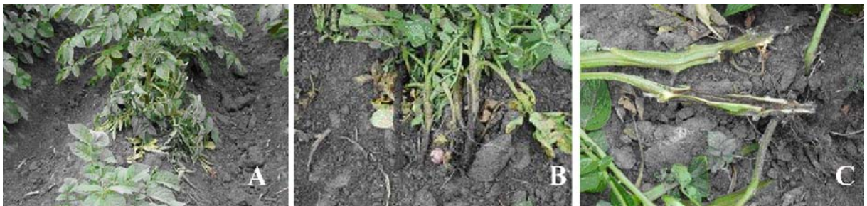
Fig. 1 Symptoms caused by Pectobacterium carotovorum subsp. carotovorum in a potato field crop in the Netherlands. a Wilting of haulms. b Darkening and rotting of above-ground stem tissue (blackleg). c Brown-discolouration of vascular tissue and pith decay

In June first disease symptoms were found, usually recognized as stem or leaf wilting (Fig. 1a) and occasionally a dark colouring of the upper leaves. At the end of the observation period, most diseased plants showed typical blackleg symptoms (Fig. 1b), although frequently blackleg was only visible below ground level, after lifting of the wilted plant. Occasionally only weak blackleg symptoms were observed. The stems of these plants, however, showed