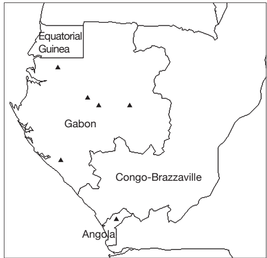
FIG. 2. — Distribution of Salacia hallei Jongkind.

Large liana. Branchlets densely lenticellate, glabrous. Leaves subopposite; petiole 1-2 cm long; blade elliptic to ovate-elliptic or oblong-elliptic, 11-26 cm × 4.5-12 cm, entire, glabrous, when dry greyish-green above and olive-green beneath; midrib prominent above, 5-7 pairs of main lateral nerves, tertiary nervation subparallel and almost perpendicular on midrib; base acute to obtuse; apex acuminate; no resinous threads present to the breaking leaf. Inflorescence subumbellate or cymose; peduncle 4-7 mm long. Flower c. 10 mm wide, completely glabrous; slender pedicel up to 18 mm long; calyx c. 2.5 mm across with short and rounded calyx-lobes, pale green, margin often fimbriate; petals orbiculate, spreading, 3.5-4.5 mm wide, pale orange; 3 stamens, c. 1 mm long, anthers very short, both in one line, pale orange; disk 1.5-2 mm wide, slightly angular, dark orange to red; style shorter than stamens; 4 to 6 ovules in two rows in each carpel; flower in bud wider than high. Fruit not known.