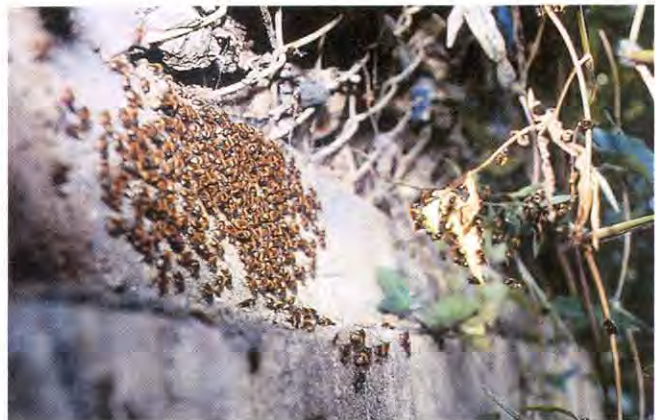
Figure 3. Drone congregation site of Melipona favosa . Hundreds of males are congregating on a vertical substrate.

ad f: so far we have not been able to assess whether invading gynes are already inseminated. Theoretically, gynes can become inseminated during different phases in this behavioural system: 1 - immediately after they leave the maternal