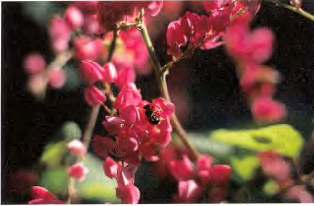
Figure 2. Gyné of Melipona favosa visiting flowers of the corolita vine Antigonum leptopus , foraging for nectar. Maagdelijke koningin van Melipona favosa foeragerend op bloemen van corolita Antigonum leptopus.

cells of which 349 contained prepupae and pupae. The second nest also contained only a few young bees and resembled the first nest, except for the fact that it contained a considerable amount of stored food.