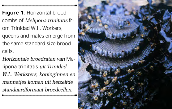
Figure 1. Horizontal brood combs of Melipona trinitatis from Trinidad W.I.. Workers, queens and males emerge from the same standard size brood cells. Horizontale broedraten van Melipona trinitatis uit Trinidad W.I. Werksters, koninginnen en mannetjes komen uit hetzelfde standaardformaat broedcellen.

Gynes were seen flying around bee-stands containing nest boxes of Melipona and at other sites where Melipona hive material was handled. Gynes were attracted to nest boxes which had been emptied recently, and landed on parts of hollow trunks from which nests had been removed. They also visited isolated structures that had been taken out of nests, such as empty food pots, involucrum, 'batumen plates' and sheets of wax. Gynes landed on these materials but quickly flew away again. They were never seen to take up anything from these objects, not even honey that had sometimes been spilt. Such visiting gynes showed an active locomotive pattern, running fast with many turns and intensively rubbing their abdomen with their hind legs. While running, they often visited shady and dark crevices. Sometimes these gynes also flew to other contrasting dark objects that were only few metres away. During this behaviour the gynes had distinctly swollen abdomens. They appeared suddenly and we have no record of where they came from or where they went to next.