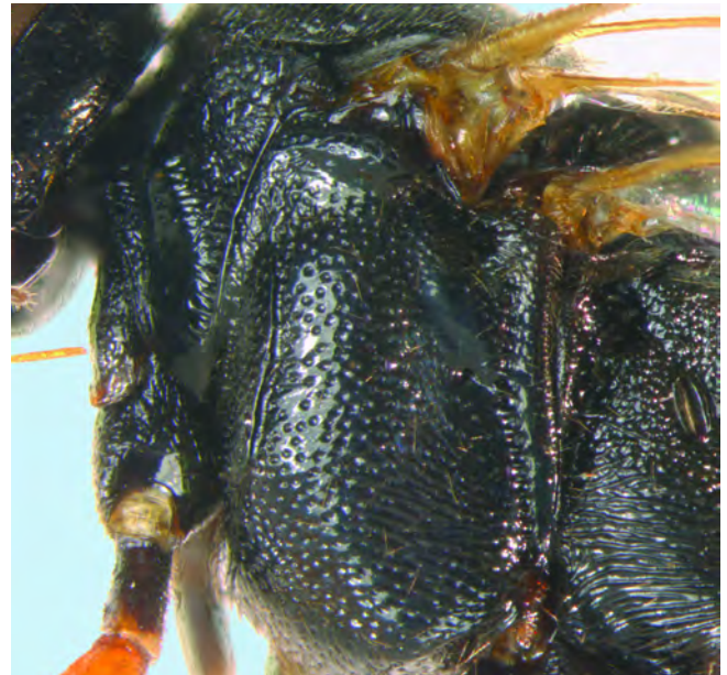
Figure 3. Pimpla rufipes ♀, mesopleuron. Pimpla rufipes ♀, mesopleuron..

All this leads to the conclusion that P. processioneae is a