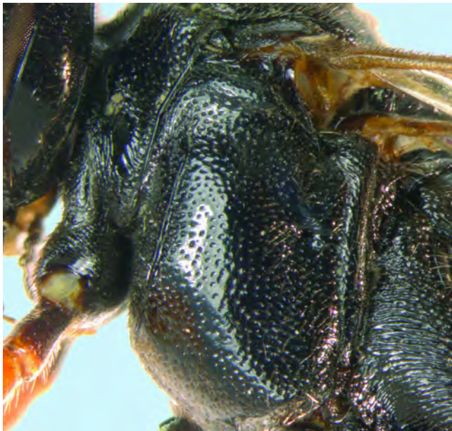
Figure 2. Pimpla processioneae ♀, mesopleuron. Pimpla processioneae ♀, mesopleuron.

In P. processioneae the punctuation on mesopleura and abdomen is generally less deep and less dense than in P. rufipes but this cannot be easily appreciated without direct comparison of both species (figures 2-3). The two humps on the postpetiolus are also less developed, giving the postpetiolus a more evenly rounded appearance. The hind femur is