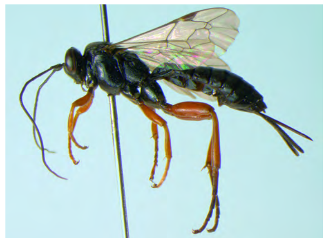
Figure 1. Pimpla processioneae ♀, habitus. Pimpla processioneae ♀, habitus.

The occurrence of this species in great numbers offered the opportunity to collect parasitoids. In 1996 some speci-