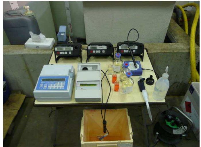
Measuring in practice (equipment Gademan)