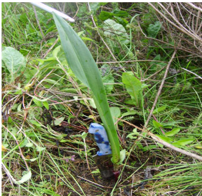
Figure 1 Satyrion atherstonei Rchb.f, edible orchid in the wild leaning on a knife.

In the context of this study focusing on wild orchid gathering (Figure 1 and Figure 2), however, the necessities of HIV/AIDS are not all that need consideration. Significantly, there is a pre-existing large market for edible orchid tubers. These two aspects combined bring incredible pressure to bear on edible orchids. Edible orchid tubers in the research area have traditionally been consumed as a midday snack food. This traditional pattern of