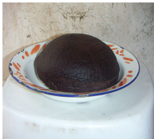
Figure 3 Chikanda , a meatless sausage produced from edible orchids.

use changed with the introduction of an international market for wild orchid tubers in southern African countries, with countries such as Zambia creating increased demand for Tanzanian orchid tubers. In Zambia, the tubers from the orchid genera Disa , Habenaria and Satyrion are the main ingredients of "chikanda" (Figure 3), a popular meatless sausage [8-10]. As edible species went into severe decline in Zambia, demands started being met from Tanzania. Between 2.2 and 4.1 million orchid plants consumed annually in Zambia are estimated as originating from Tanzania [11]. One orchid plant produces one edible tuber (roughly the size of one small Irish potato)