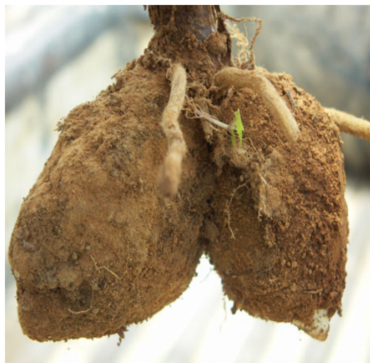
Figure 2 Edible orchid tuber. Non-consumable old depleted tuber depicted on left with newly formed consumable tuber on the right.

use changed with the introduction of an international market for wild orchid tubers in southern African countries, with countries such as Zambia creating increased demand for Tanzanian orchid tubers. In Zambia, the tubers from the orchid genera Disa , Habenaria and Satyrion are the main ingredients of "chikanda" (Figure 3), a popular meatless sausage [8-10]. As edible species went into severe decline in Zambia, demands started being met from Tanzania. Between 2.2 and 4.1 million orchid plants consumed annually in Zambia are estimated as originating from Tanzania [11]. One orchid plant produces one edible tuber (roughly the size of one small Irish potato)