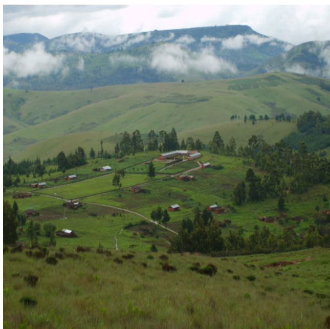
Figure 5 Photo of the research area landscape.

patterns, perceived abundance of the species known to the informants, and source of orchid tuber gathering knowledge.