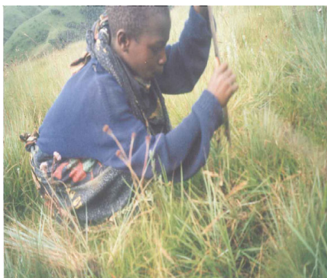
Figure 8 AIDS orphan in the process of digging out an orchid tuber.

orchids. More than two million orchid tubers find their way illegally to the markets of Zambia annually. This dependence on wild gathered products was anticipated in high prevalence HIV/AIDS communities. Increased dependency on wild gathered products usually follows a reduction of agricultural production or shortage of labor to perform farm activities [5,7]. In such rural contexts, affected households tend to increasingly depend on natural resources. However, considering the high market demand for edible orchid tubers, cash income may also be an incentive to gather among non-HIV/AIDS affected gatherers.