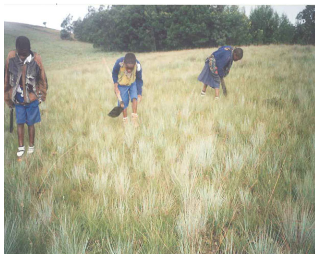
Figure 7 AIDS orphans gathering wild edible orchid tubers.

The significant difference in gathering frequency observed between AIDS orphans and others illustrates the precarious position of AIDS orphans. These children probably have a deep need to obtain cash income and must make their own way in the world. Gathering orchid tubers requires only the input of their own labor for a relatively high return, given the market demand for the edible