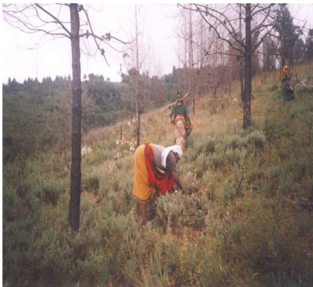
Figure 6 Women gathering wild edible orchid tubers.

Further analysis reveals that HIV/AIDS affected gatherers differ significantly from non-HIV/AIDS affected gatherers in terms of gathering knowledge acquisition. A chi square test reveals that the source of gathering knowledge was significantly different for the two major categories of gatherers, HIV/AIDS and non-HIV/AIDS affected ( X^2 = 61.846 , P < 0.000 , df = 4 ).