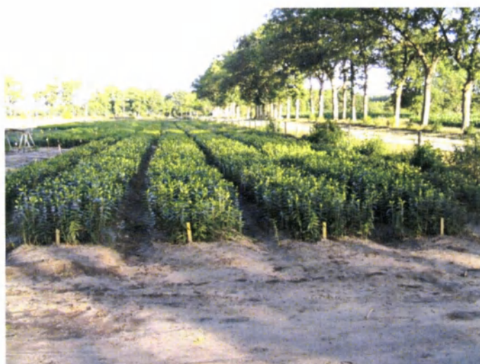
Overview of experiment H0713 in Vledder

During the growth season the crop standing was assessed three times. There were no differences in crop stand between the different treatments.