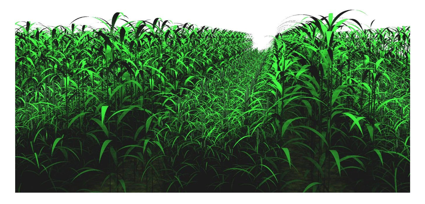
Figure 2. Visual output of a maize-wheat intercrop canopy simulated using FSP modelling, showing the spatial resolution at which plants and their organs are represented. In this particular model, plant and organ sizes are the result of competition for light only, based on the cycle light capture – photosynthesis – assimilate allocation – organ growth – light capture. Details on model functionality can be found in Evers and Bastiaans (2016).