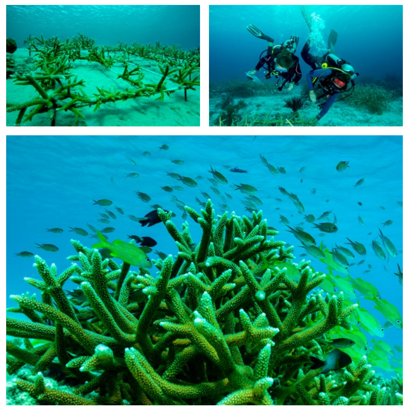
Above left: when the coral fragments are big enough, they are returned to special structures on bare stretches of the coral reef, so they can grow into large colonies (below). Above right: students from Wageningen measure the growth of the returned corals.

'We are studying why certain corals are more vulnerable than others'