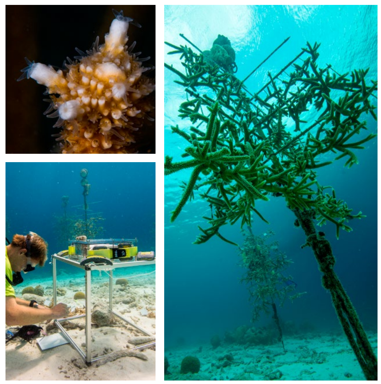
Above: the staghorn coral: the individual polyps it consists of are clearly visible. Each polyp is a clone. Right: coral fragments hang in a 'coral tree' where they grow, out of danger from predators. Below: a student weighs coral fragments.