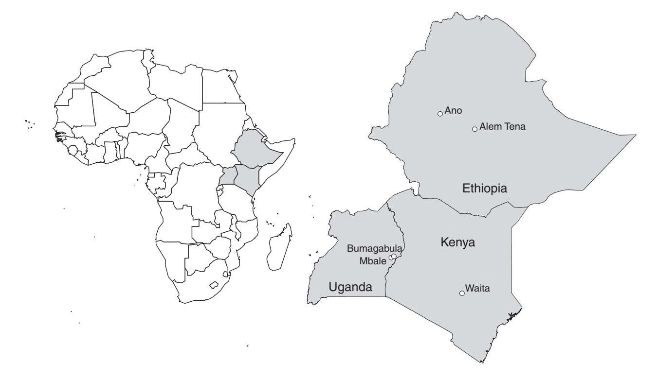
FIGURE 1 Maps of the five study locations across three countries in East Africa. See Table S1 and methods for more information

Soil erosion prevalence was scored at each subplot (n = 640 observations per site), when erosion was observed in over half of the four subplots per plot, this plot was considered to be severely eroded (binary 0/1). Topsoil samples (0–20 cm) were collected at each subplot and