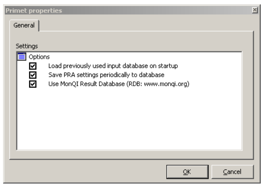
Figure 28. The PRIMET properties screen

The PRIMET properties screen (Figure 28) appears after clicking the button Options.