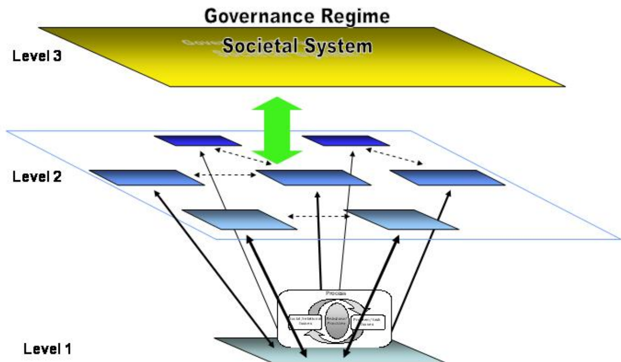
Fig. 2. Three-level representation of multiscale social learning processes: (1) Level 1 (micro): the multiparty collaboration process in which representatives from different stakeholder groups interact. As indicated, this level refers to the process level in the center of Fig. 1; (2) Level 2 (meso): the actors in the water management regime consisting of more or less organized stakeholder groups, e.g., authorities, associations, who may partly engage in bilateral interactions; and (3) Level 3 (macro): the governance and societal structural conditions that are characterized by cultural values, governance regime, or power structures. This level is identical to the conceptual framework illustrated in Fig. 1.

of shadow networks for adaptive governance is a self-organizing process often triggered by a social or ecological crisis. Nooteboom (2006) provided evidence for the importance of adaptive networks in sustainability transitions. Adaptive networks are self-organizing groups of policy makers who enable joint fact-finding and visualize how to achieve the desired improvements.