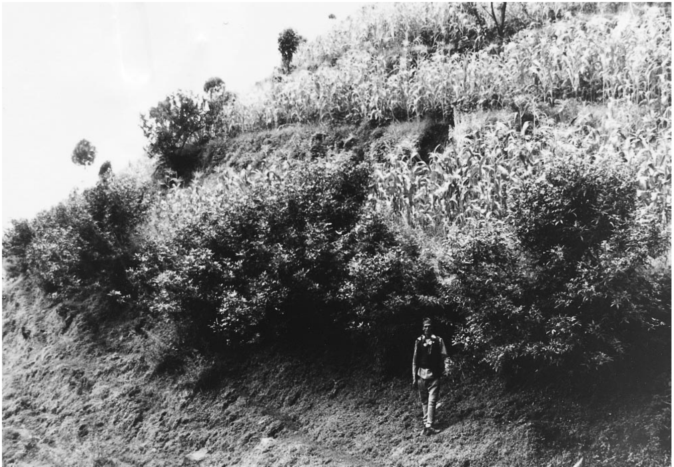
FIGURE 2 Cultivation of timur on terrace risers on private lands.

germination. Timur can also be propagated vegetatively from branch cuttings or seeds. Timur flowers regularly around April to May and produces constant fruit yields over the years. However, hailstorms in spring can destroy the flowers.