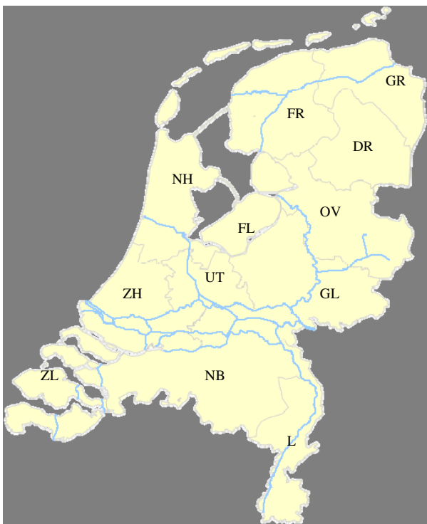
Figure 1 Geographical location of the twelve provinces in the Netherlands (DR: Drente; FL: Flevoland; FR: Friesland; GL: Gelderland; GR: Groningen; L: Limburg; NB: North Brabant; NH: North Holland; OV: Overijssel; UT: Utrecht; ZH: South Holland; ZL: Zeeland).

A total of 1,627 sheep samples (38.3%) from 149 locations with sheep (69.6%) were seropositive. The BTV8-seropositive locations with sheep were located in all prov-