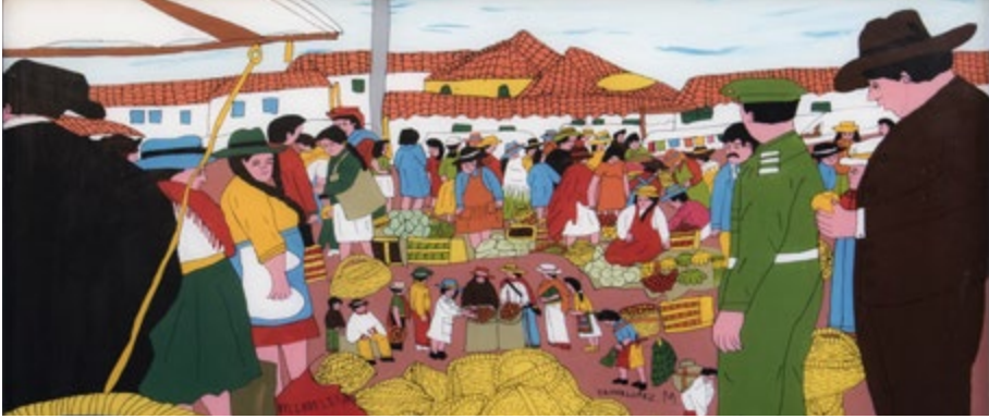
Figure 1: Marginal but also centre stage

networks that increasingly control the production, processing, distribution and consumption of food. Where such food empires control markets, peasant movements are creating new peasant markets and arguing for the principle of food sovereignty. Where food empires aim to monopolize genetic material, peasant movements defend the democratic access to living nature. Where food empires actively induce poverty and marginality, peasant movements fight for emancipation. In short: peasant movements are an indispensable part of the checks and balances that keep our societies liveable.