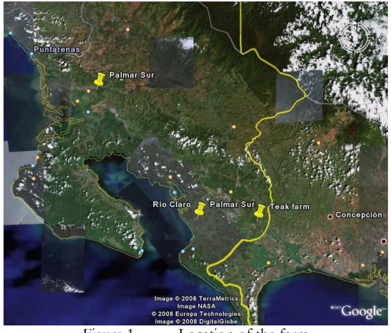
Figure 1 Location of the farm

This report has been prepared at the request of Stichting Terra Vitalis, Heuvel 13, Oosterhout, The Netherlands. The Stichting has requested a second opinion on the drainage plan prepared by the BARCA Company for Farm 70, Salamá, Piedras Blancas, Puntarenas, Costa Rica. This teak farm is located in the southwest region of Costa Rica (8° 30' 79 - 8° 30' 64 and 82° 53' 87 - 82° 54' 03), a region characterized by high rainfall, especially in the period May to November. The BARCA Company is developing the area as a teak reforestation plantation. Because of the heavy rainfall intensity, flat topography, soils with low hydraulic conductivity and impermeable layers close to the soil surface, an intensive drainage system is required. The drainage plan covers an area of 72.56 ha.