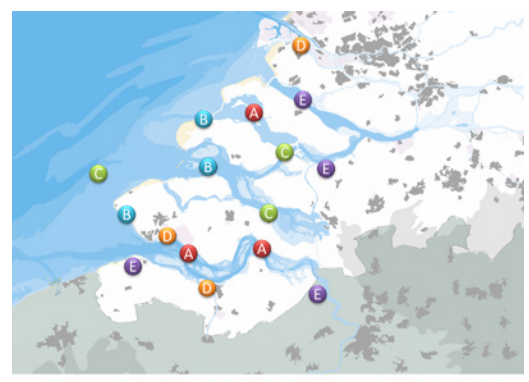
Living Laboratory Enhancing Delta Resilience

To change these opportunities into new concrete innovation projects Delta Academy will continue and expand the collaboration with companies, governmental organisations, NGOs, consulting firms, other higher education and research institutes. Together we can establish a Living Lab Enhancing