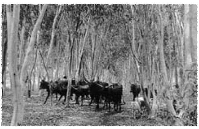
During the day, nomads and sedentary farmers like to use shelterbelts for shading their cattle and themselves.

At the moment the Forestry Department does not seem to have any plans for improving the efficiency of the shelterbelts. Present policy, financial restrictions and the lack of a tradition, at the official level, of participatory approaches to these types of issues are important constraints. At present, no workable solutions to the problems associated with existing shelterbelts are being developed, and alternative options, such as parkland agroforestry to rehabilitate soil and stop desertification, are not being considered.