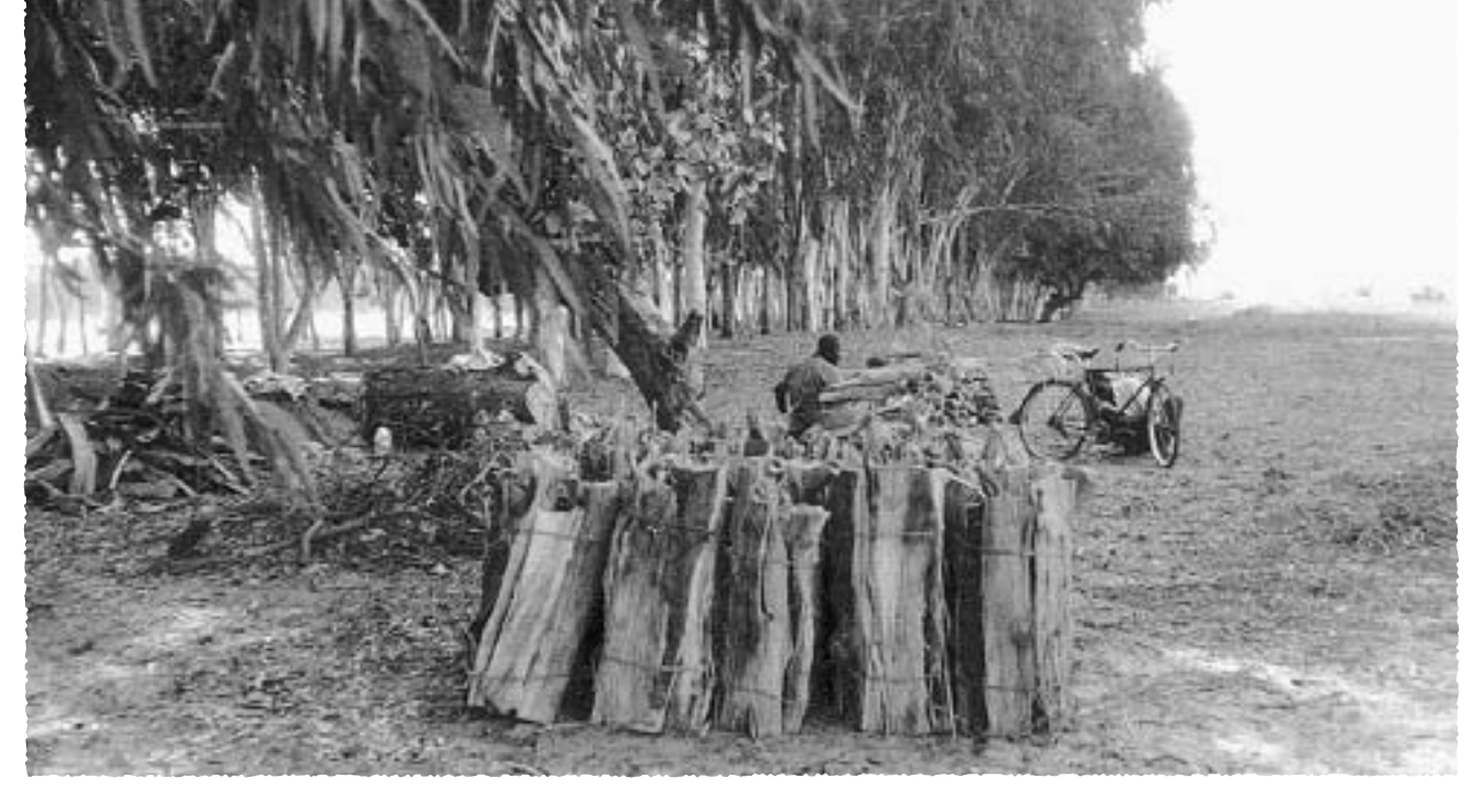
Selective wood harvesting from shelterbelt trees by the government, not by the farmers.