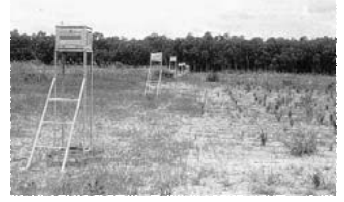
Shelterbelts were established too far apart.