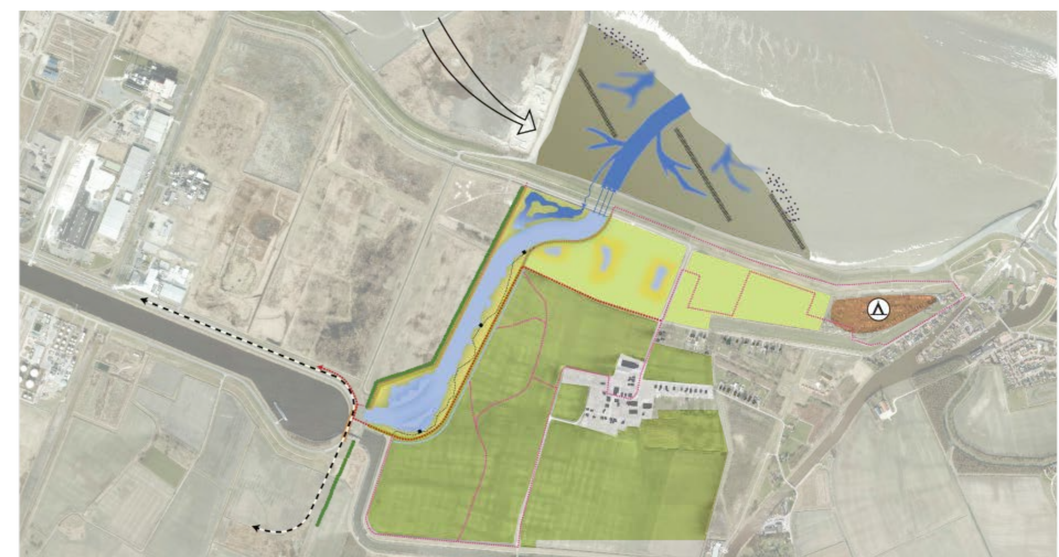
Figure 3. Proposed design of the freshwater outflow at Delfzijl including the development of an estuarine gradient with salt marshes, freshwater wetlands and fish passage.