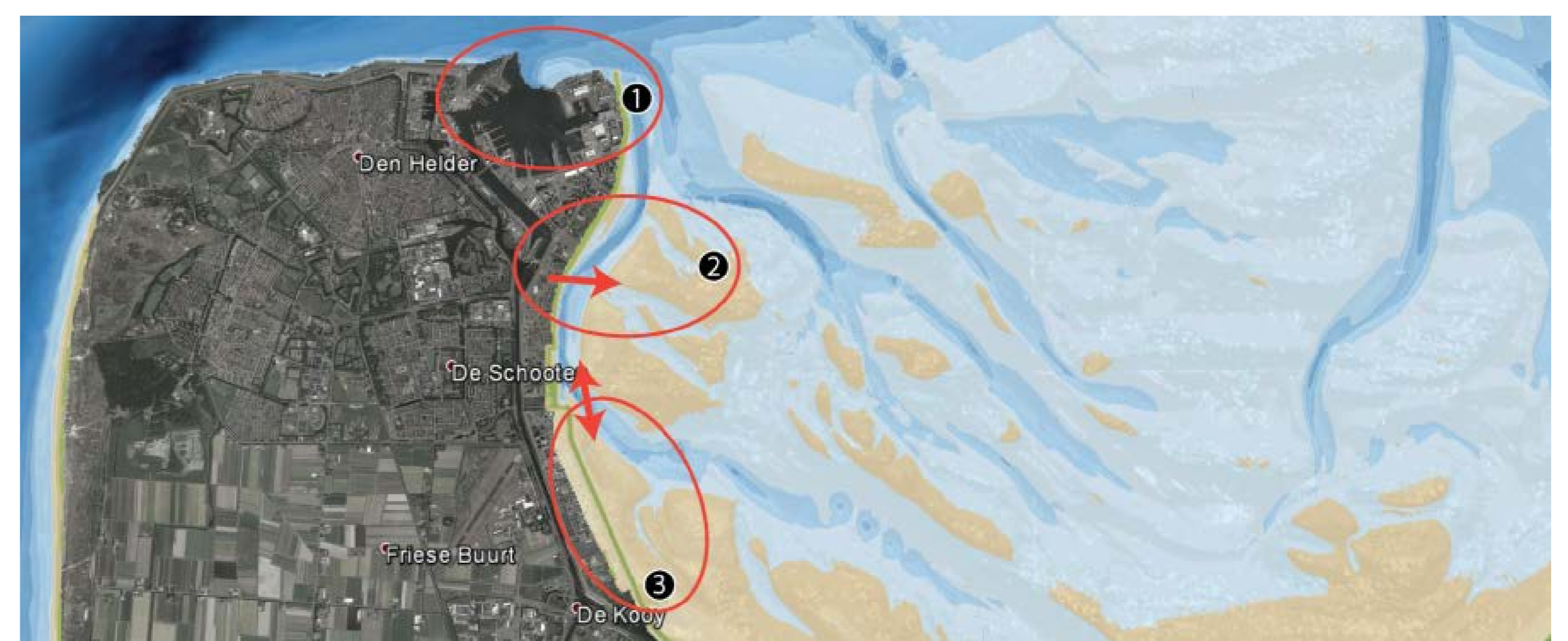
Figure 4. Project locations around the Port of Den Helder, (1) modification of entrance lay-out; (2) relocation of freshwater discharge and (3) fish migration estuarine gradient.