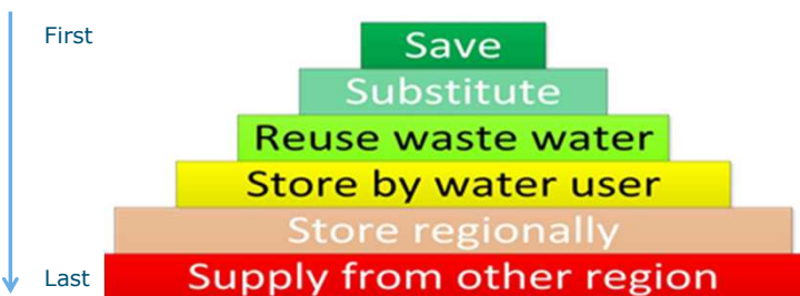
Figure 1 The freshwater scarcity adaptation hierarchy