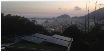
#4 Provide high quality basic services to all citizens, through sustainable and resilient use of resources