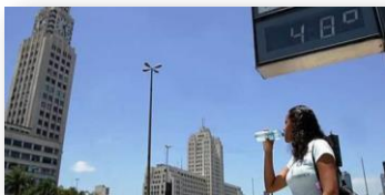
#1 Increase the knowledge and mitigate impacts of severe weather and climate change