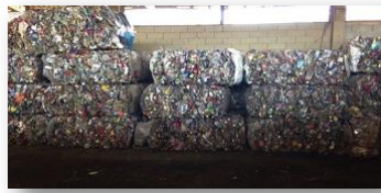
#5 Promote an inclusive, diversified, circular and low carbon economy.