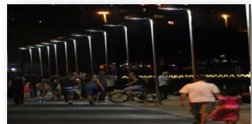
#3 Cultivate green, cool, safe and flexible urban spaces.