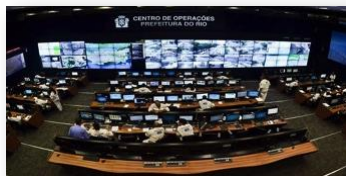
#2 Mobilize Rio to be prepared to respond to extreme weather events and other shocks.