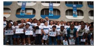
#6 Increase the overall resilience of citizens and promote social cohesion