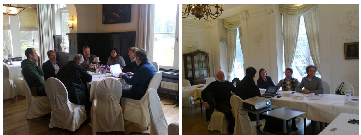
Figure A3.1. Group discussion for Breeding Programs (left) and Environment (Right)

In order to get an overview of the expected challenges – or call them knowledge gaps/important topics to work on – and to avoid duplication of research, we constructed an outlook of the challenges ahead of us. During the workshop, we asked the participants to more accurately describe their group topic (to check our conceptual frame work), to define sub topics if required, the key players, and most importantly the short-term (until 2020), mid-term (until 2025) and long-term (beyond 2025) challenges (Figure A3.1). For the group members see Appendix 1, where different colours show different groups; orange is called Environment (Table A3.2), green is called Natural selection (Table A3.3), blue is called Breeding Programs (Table A3.4), and. We asked the groups to fill in a prepared table (below) and present the outcome in a plenary session following the discussion in smaller groups.