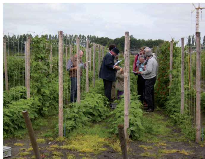
Members of the network inspecting the regeneration of the network's bean collection at CGN.

The Orange List is an evolving list of more than 3000 vegetable varieties grown between 1850 and 1940 in the Netherlands. The names, descriptions and photo's of these varieties have been found in variety lists, seed catalogues, literature and via personal communications. Information on possible availability of these old varieties has been added by searching EURISCO and heirloom seed websites.