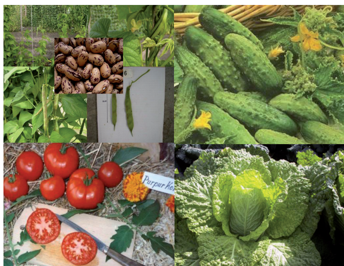
Available old varieties in the Orange list.