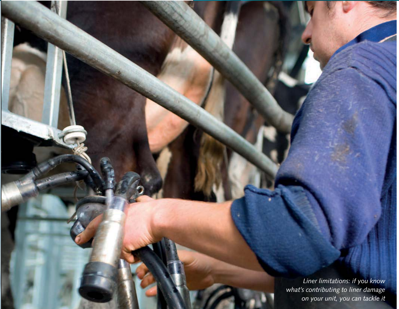
Liner limitations: if you know what's contributing to liner damage on your unit, you can tackle it

wash well too – that's just as vital." He explains that if liners don't fit the jettors properly then they won't wash well and it will eventually affect the liner performance and durability.