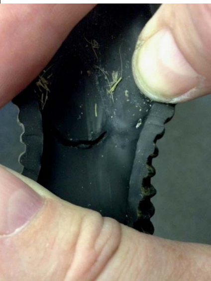
Right: Leaving jettets attached to liners between milkings can deform the mouth of the liner