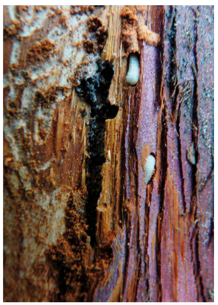
7. Overwintering Phloeosinus rudis larvae in the bark.

7. Overwinterende Phloeosinus rudis larven in de bast.