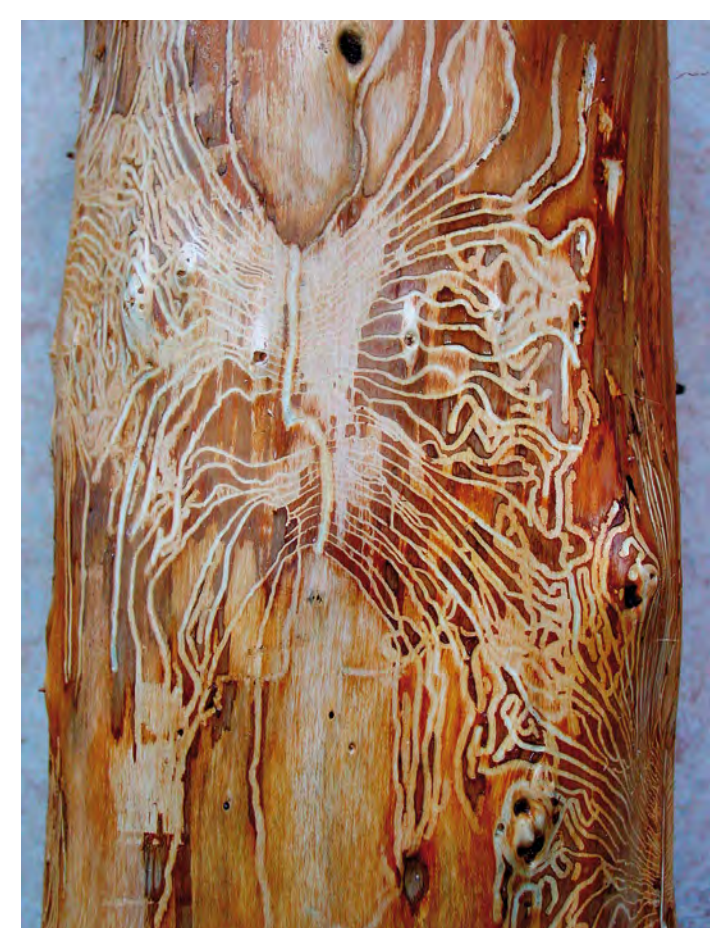
4. Trunk of 60-year-old Thuja with the longitudinal egg gallery and transversal larval galleries of Phlocosinus rud is. 4. Stam van een 60-jarige Thuja met het broedbeeld van Phlocosinus rud is, een verticale moedergang met horizontaal uitwaaierende larvengangen.

In 2004, infestations of P. thujae were observed in the Dutch cities of Veenendaal (Gelderland, in a hedge of Juniperus chinensis ), Nijmegen (Gelderland, hedge with unidentified conifers), Doetinchem (Gelderland, 15-year-old Thuja ), Venray (Limburg, hedge of Chamaecyparis ) and in Thuja at Boskoop (Zuid-Holland)