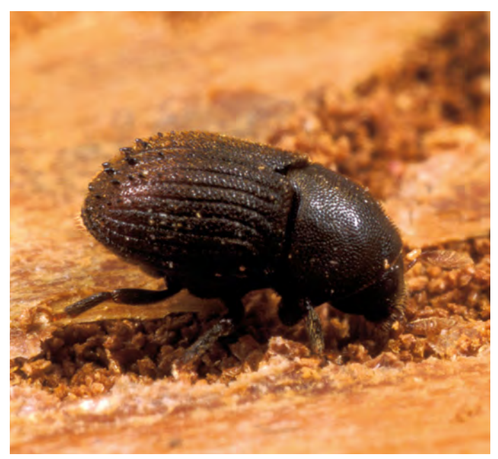
6. Adult of Phloeosinus rudis. 6. Een adult van Phloeosinus rudis.

Juniperus communis is a protected indigenous shrub species in The Netherlands, mainly growing on heath lands in nature reserves. Until now, no infestations of P. rudis were found on this shrub in The Netherlands. In Germany, P. bicolor and P. thujae seem not to be able to disperse over a large area, because the infestations occur only locally in certain cities. The wild Juniperus communis grows far away from cities and seems here not really endangered (Sobczyk & Lehmann 2007). However, in North-America it was demonstrated that Phloeosinus chamberlini Blackman 1942, had dispersed over about 24 km (Furniss & Furniss 1972). The widespread infestations in 2004 about 30 km around Rotterdam also suggest that P. rudis may have a good active dispersal capacity and it may not be excluded that it may colonize heath lands from infested urban areas in the long run. It remains unclear what the impact of P. rudis on J. communis will be.