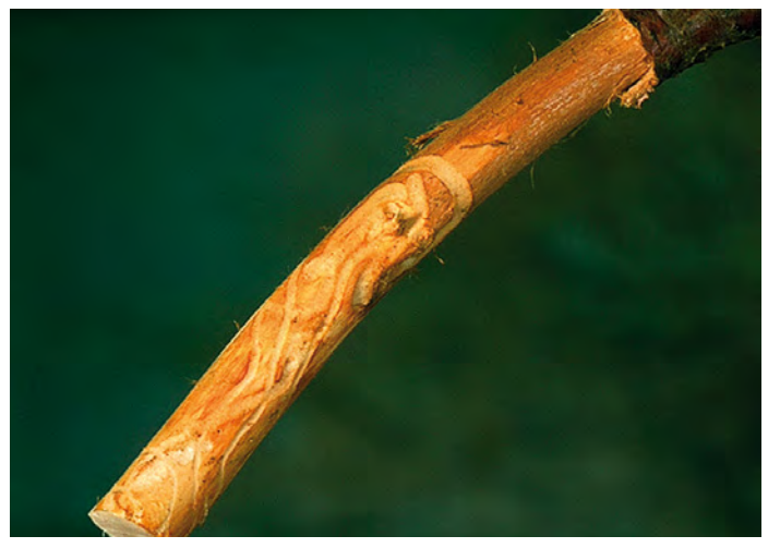
2. Maturation feeding of adult Phloeosinus thujae in a small branch.

In 2004, the year of the first infestations, all records from the Alterra monitoring project are situated within a range of about