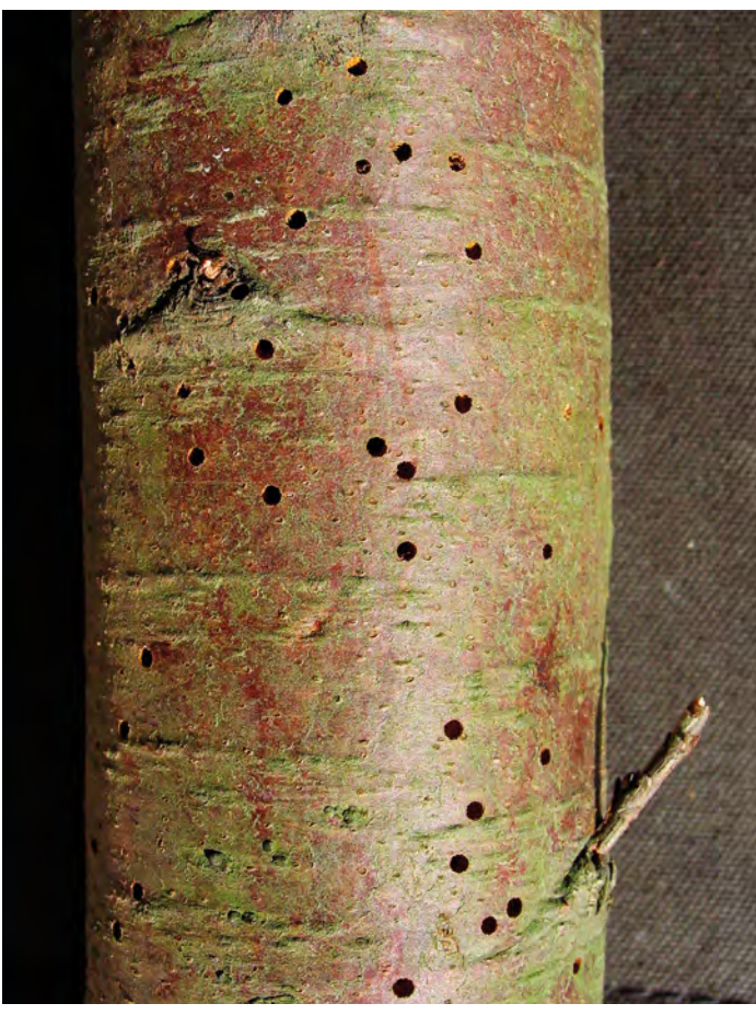
5. Exit holes of young Phloeosinus rudis beetles. 5. Uitvlieggaatjes van jonge Phloeosinus rudis kevers.