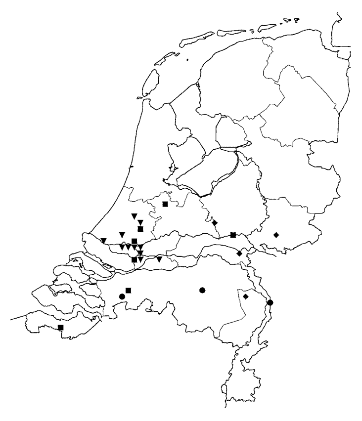
8. Records of infestations by Phloeosinus rudis (♥), P. thujae (♠), P. bicolor (♠) and Phloeosinus spec. (■ - unidentified Phloeosinus species) in 2004 as derived from the Alterra monitoring scheme. Not all records are visible, due to some overlap in sites for the separate species. 8. Waarnemingen uit het Alterra monitoringsproject van aantastingen door Phloeosinus rudis (♥), P. thujae (♠), P. bicolor (♠) en Phloeosinus spec.

7. Overwinterende Phloeosinus rudis larven in de bast.