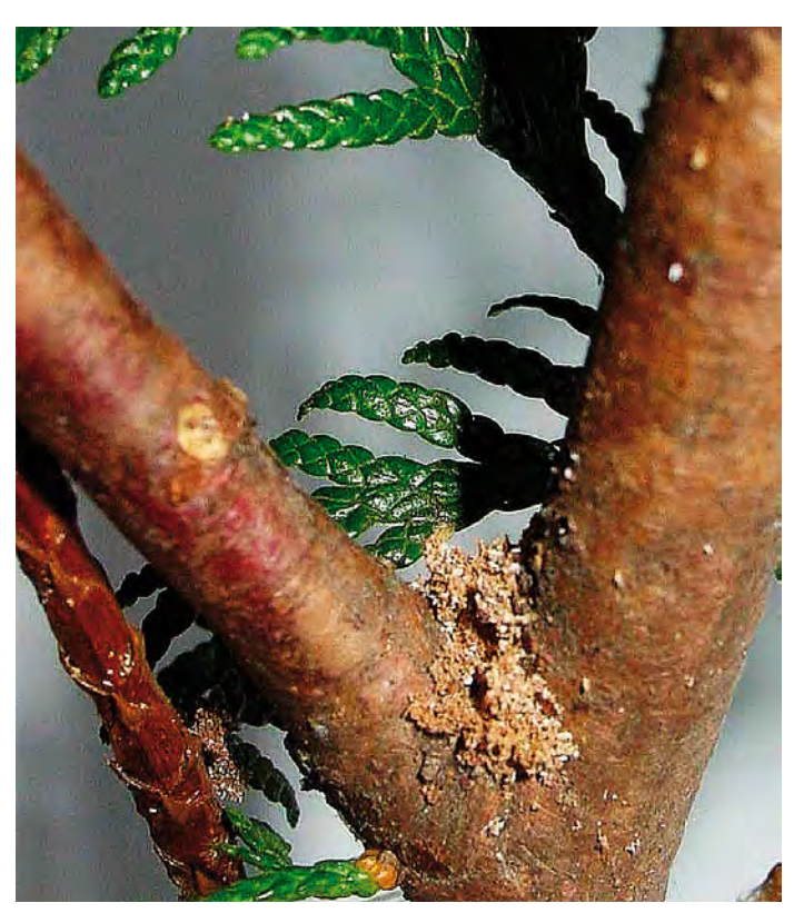
{\bf 1.} Starting maturation feeding of a dult {\it Phloeosinus\ rud} {\it is.}