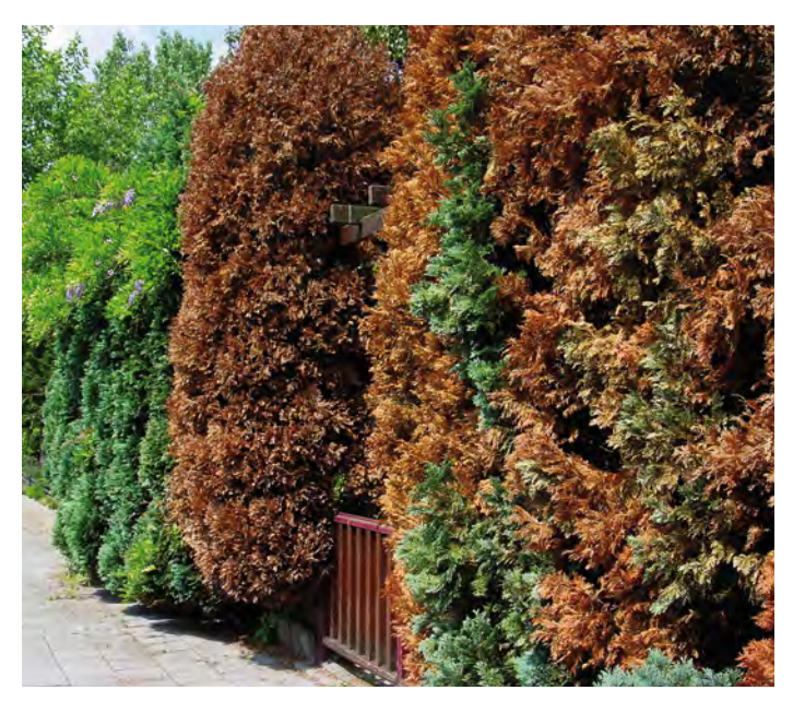
3. Hedge of Chamaecyparis with dead shrubs infested by the Japanese cypress bark beetle, Phloeosinus rudis . 3. Heg van Chamaecyparis met dode struiken aangetast door de Japanse thujabastkever, Phloeosinus rudis .