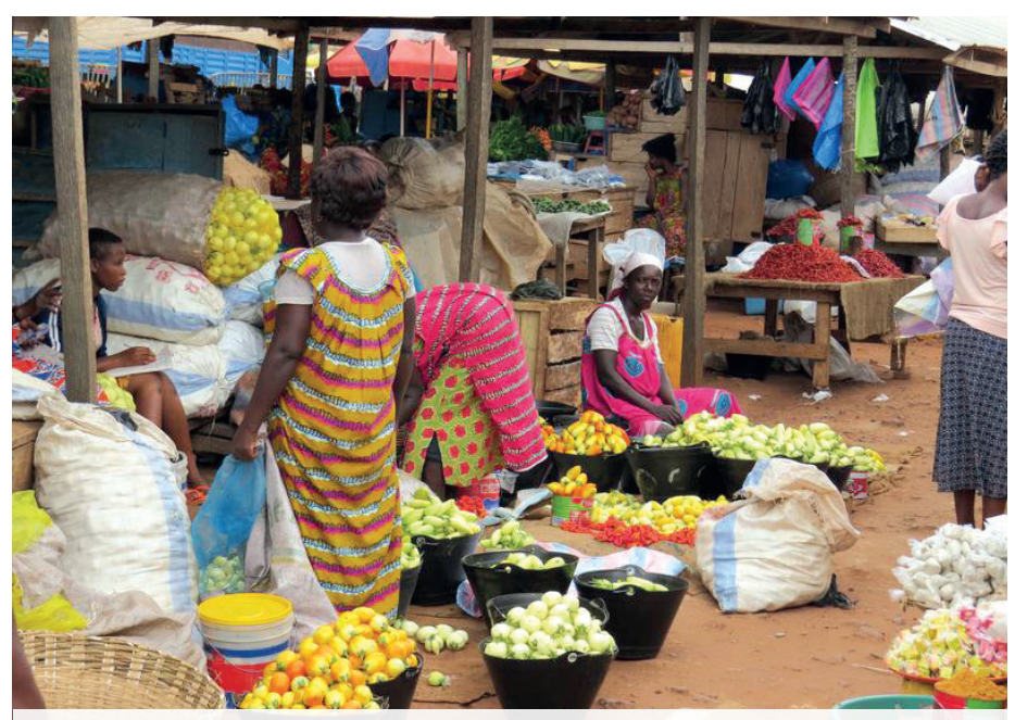
Open air vegetable market in Techiman II.