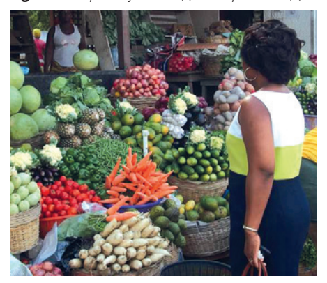
Figure 4.7 Open air food stall (L) and supermarket (R) in Accra

Until some years ago vegetable exports from Ghana were gradually growing, capturing a sizeable portion of the ethnic vegetable niche market in the UK and EU. This as a result of its clear advantage in terms of airfreight costs compared to current East African suppliers. However, despite to some commercial success, today's market is just a fraction of what it was, although it maintains a respectable share of the ethnic market especially when it comes to Ghanaian chilli.