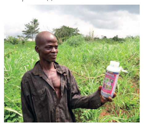
Figure 4.5 Farmer showing the pesticide product he uses on his vegetable crop (L) and a farmer spraying his tomato crop without protection (R)

Most of the above problems of the excessive and improper use of pesticides result fr om a lack of knowledge and awareness among farmers, which in turn arises from lack of sufficient training, advice and information provided to them. MoFA and its extension service provides only limited training and advice to farmers, this is insufficient to capacitate them with regard to judicious use of pesticides (see Box 4.2).