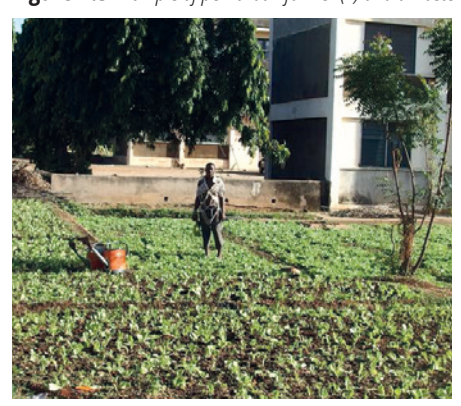
Figure 4.3 Example of peri-urban farmer (L) and a waste water as source for crop irrigation (R)

Medium-large-sized farmers produce for the urban, regional as well as the export markets. Most of the larger exporters source produce from a number of smallholders, which hampers traceability. Depending on the export market they are aiming for, companies may have quality certifications in place (e.g. GlobalGAP).