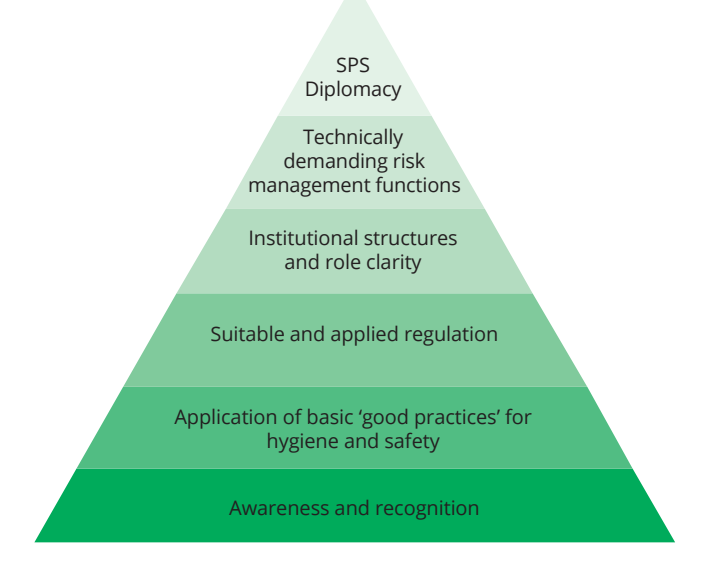
Figure Hierarchy of trade-related SPS management functions & responsibilities.

With broad awareness and common application of good practices, many potential SPS risks can be effectively managed. However, even if individual farms and enterprises apply good practices, they may not be able to control all hazards. There are also cases where broader oversight and systematic or collective action is necessary, requiring basic research, surveillance systems, and quarantine and emergency management systems. A proper regulatory framework for application or regulation is therefore needed.