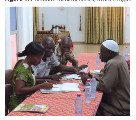
Figure 1.1 Validation workshop Tamale, Northern Region