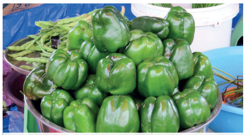
Products for sale from open air vegetable market in Techiman

However, when the SPS system functions effectively it will ensure that standards are met, food safety and plant health risks are reduced, confidence towards trading partners is created and market access is achieved and maintained. This in turn will contribute to increased trade of food and agricultural products.