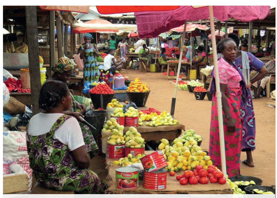
Open air vegetable market in Techiman I.