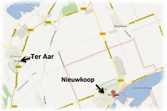
Figure 5. Zoomed closer to the location of the Nieuwkoop municipality in the Netherlands (Google maps, 2013)