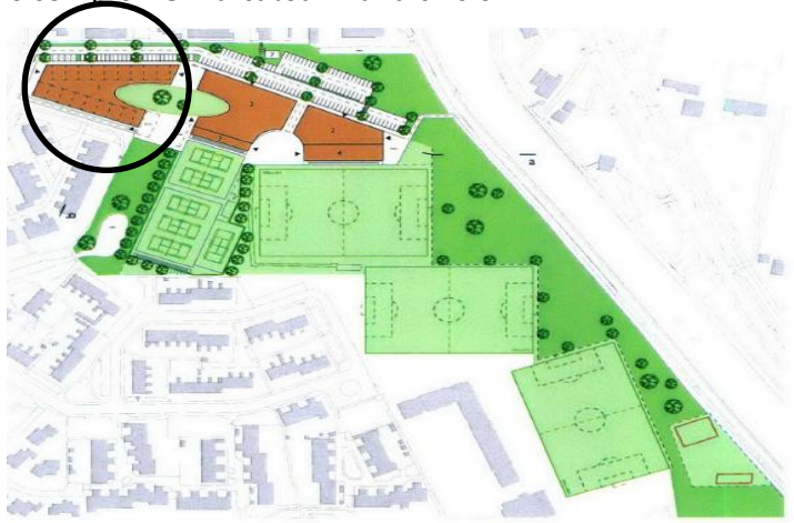
Figure 6 . The map of the 'Vernieuwd Verbonden' project (Nieuwkoop Municipality, 2006)

In figure 6 is shown how the setting looks like where the whole project 'Vernieuwd Verbonden' is planned. The planned residential care complex is indicated with a circle.