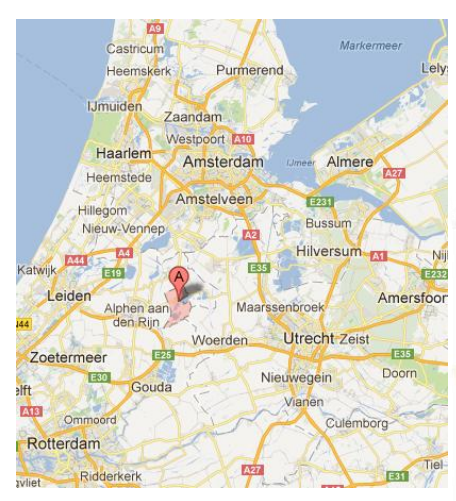
Figure 4. Location of the Nieuwkoop municipality in the Netherlands (Google maps, 2013)

Nieuwkoop is a municipality in the Dutch province Zuid-Holland. Nieuwkoop is situated close to Alphen aan de Rijn, in the middle of the 'Groene Hart' (The 'Green Heart'), which can be seen in figure 4 and 5. The municipality Nieuwkoop has been merged on January 1<sup>st</sup> 2007 with the municipalities Ter Aar and Liemeer. This new municipality also has the name Nieuwkoop. Nieuwkoop has currently 27.073 inhabitants (Gemeente Nieuwkoop, 2013).