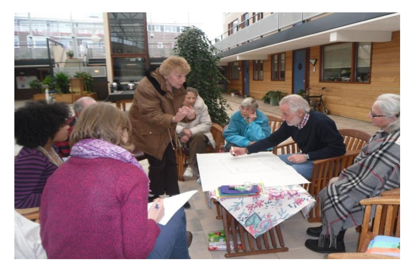
Figure 2. The focus group in the residential care complex in Langeraar