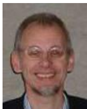
Prof.dr. Piet Rietveld

Session 3.2 Infrastructure and Networks (Theme 5)