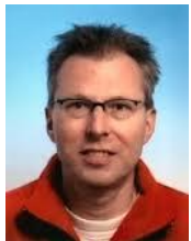
Prof.dr. Bert Holtslag

Session 3.2 Infrastructure and Networks (Theme 5)