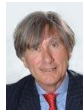
Prof.dr.s. Gerlach Cerfontaine