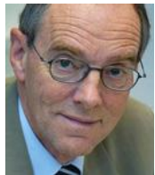
Prof.dr. Herman Eijsackers Wageningen UR the Netherlands

Session 1.2 Climate Proof Fresh Water Supply (Theme 2)