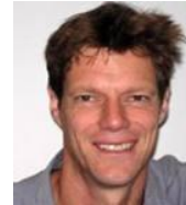
Prof.dr. Bram Bregman

Session 1.2 Climate Proof Fresh Water Supply (Theme 2)