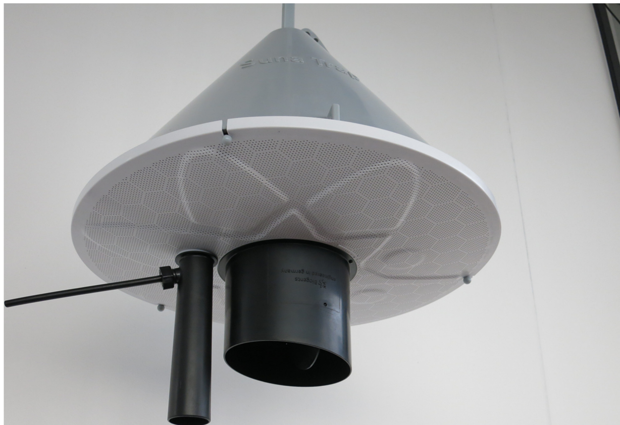
Figure 3 Suna trap with a plastic base with fine holes.

A report compiled from routine informal conversations with household members during the period they had a SMoTS for piloting revealed that households expressed