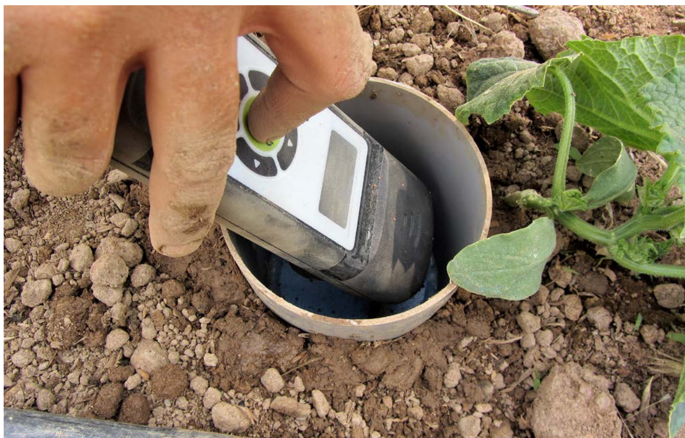
Figure 2. The AquaTag placed in a PVC jacket with a cucumber cultivation.

In general, manual control of irrigation can lead to over doses of water invoking drainage, or under doses leading to yield reduction. By using soil moisture sensors to control irrigation, up to 50% of water can be saved, while maintaining crop yields and quality [1]. Optimal use of water also reduces leaching of fertilisers. Horticulture, especially in (semi) arid areas, can benefit thereof. Existing soil moisture sensors are relatively expensive, and while sensors only measure locally and moisture content may vary largely within a valve section, their use can become very costly. The AquaTag (Figure 1) is a new, patented concept of a non-contact soil moisture meter [2]. It has low cost and can thus be used in large numbers in order to determine an average true moisture content of a valve section. The AquaTag was initially developed in the Netherlands for irrigation management of container plants [3]. In this project it was successfully demonstrated in greenhouses for soil-grown vegetables in Turkey in a greenhouse area nearby Izmir. The main aim was to keep the technology easy accessible for small-scale growers, and give them possibilities for saving water, fertilizer, energy and operational costs, under sub-optimal growing conditions.