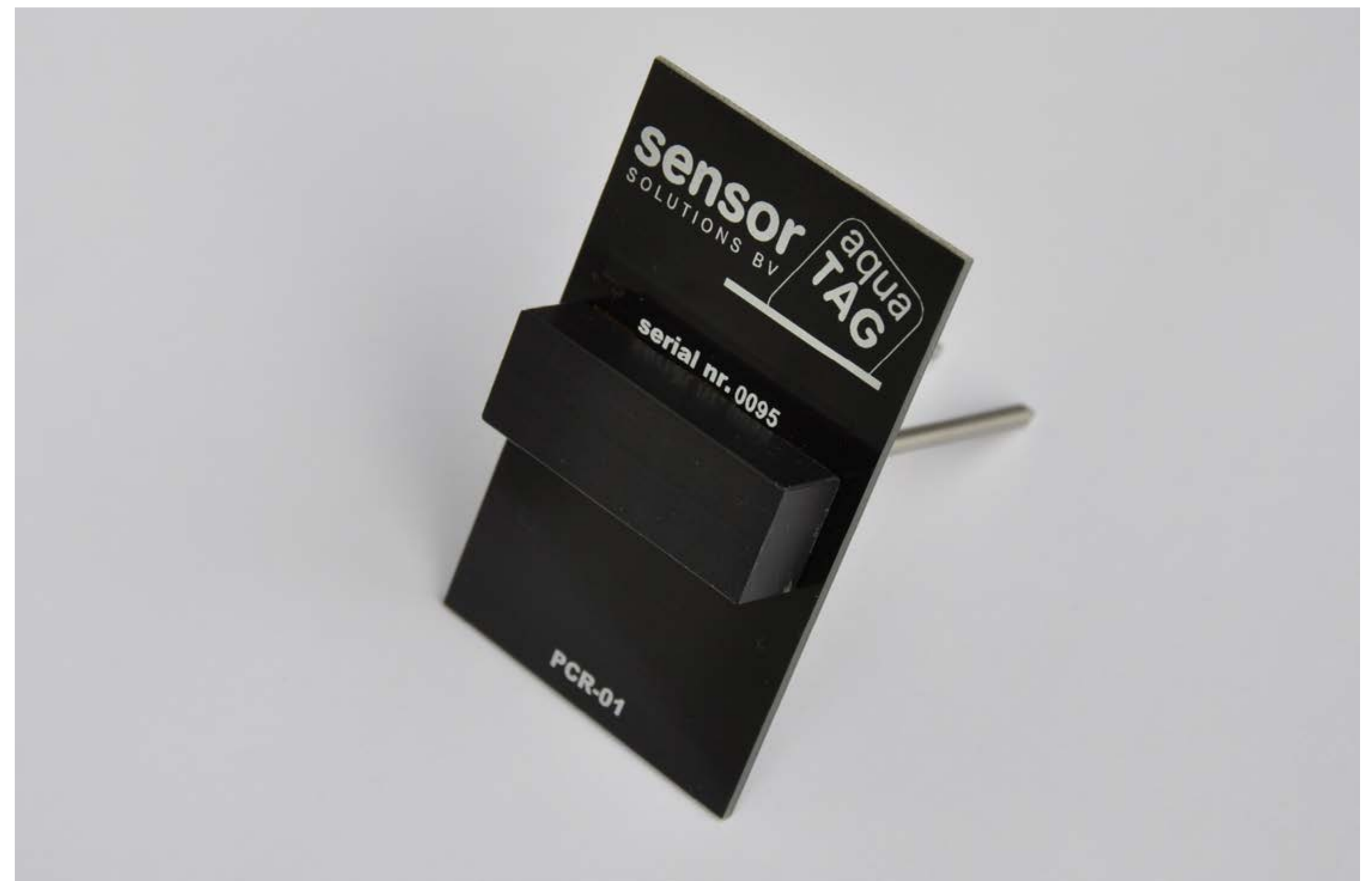
Figure 1. The AquaTag (version for container plants shown, long pin version for soil available).