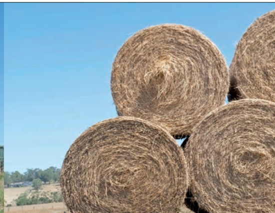
Hay is fed to the herd during drier periods

of grass available, it is sometimes mixed with sources of protein like rape seed or lupin. If the quality of the meadow grass declines too much, during wet weather, Gavin balances the feed ration with high quality hay.