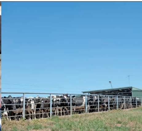
Cows waiting in the collecting yard