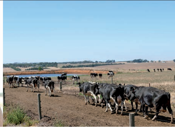
Extreme conditions: milking in a tough climate

Gavin O'Brien prefers a good night's sleep to a big pay packet