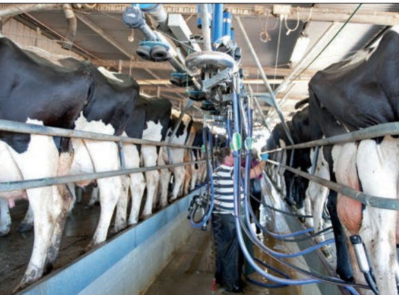
Swing-over parlour is used to milk the herd