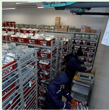
Packing in the -20°C storage rooms of CGN