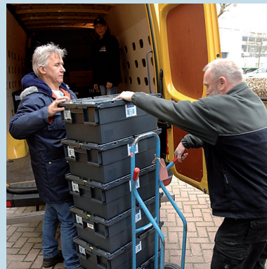
Coaching the transport van