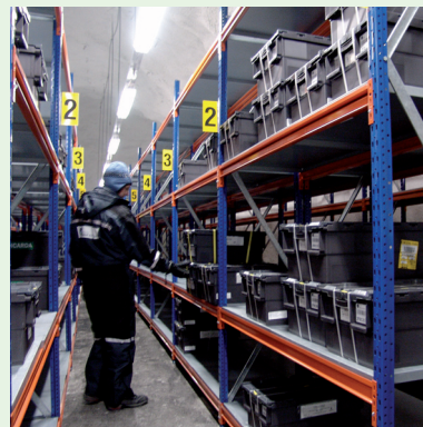
One of the three Svalbard storage rooms