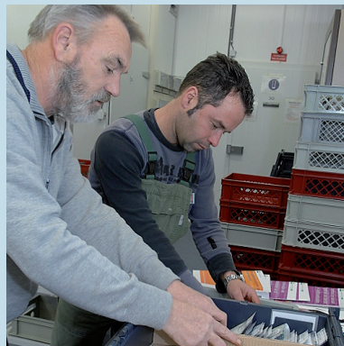
Filling the storage boxes