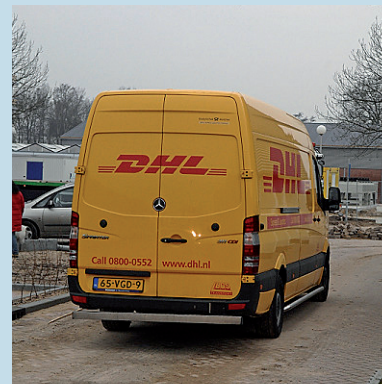
Start of transport