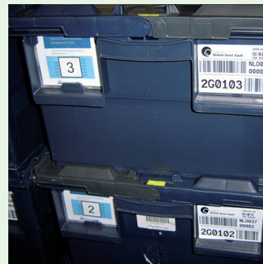
CGN; boxes at their final destination