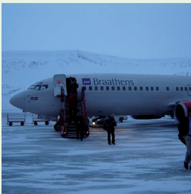
Arrival at Svalbard