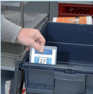
Labeling the storage boxes