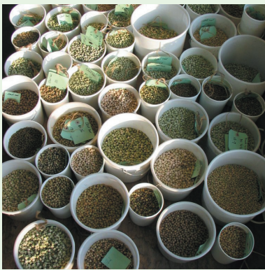
Seeds in the genebank (pea)