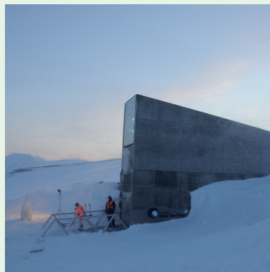
Entrance of the Svalbard Seed Vault