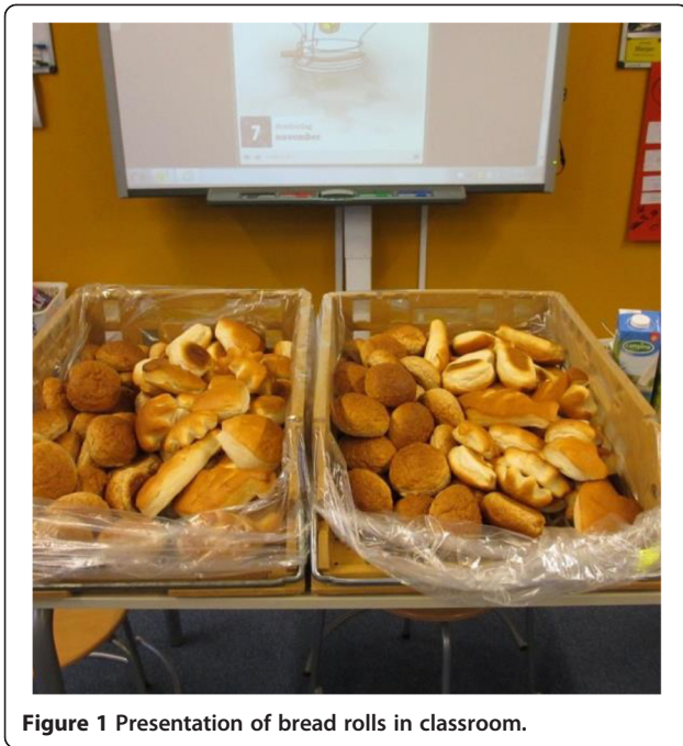
Figure 1 Presentation of bread rolls in classroom.

exchange bread rolls with them. After breakfast, children were asked to fill in a questionnaire (see Survey).