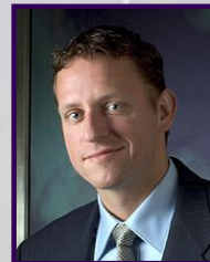
Peter Thiel Main donor