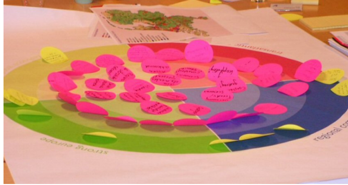
Figure 3 Maps, graphs and post-it memos were used to help the workshop participants expressing their visions.

The 'interdisciplinary' workshop developed discontinuous storylines by identifying and systematically evaluating the direct and indirect effects of extreme events (Van 't Klooster, 2007b). The participants used maps, clay, paper sheets, post-it memos and marker pens to visualize their insights (Figure 3 and Figure 4).