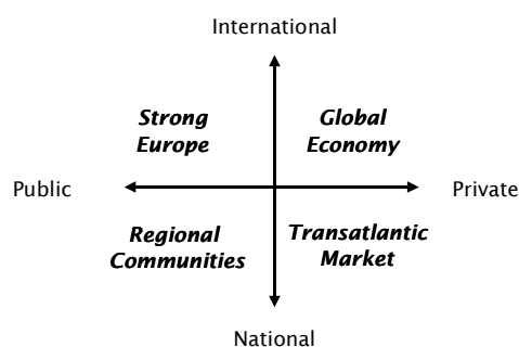
Figure 2 In the scenario axis method two key drivers or uncertainties determine the story lines. In WLO (2006) the drivers are globalization and individualization. Although the terminology is usually different, the other scenarios in Table 1 have a similar set up. Hence the SRES A1 scenario is comparable to the WLO scenario Global Economy.

Storylines are qualitative descriptions of socioeconomic trends. For example, the storyline Global Economy includes phrases such as (WLO, 2006): ‘European governments concentrate on their core tasks, such as the provision of pure public goods and the protection of property rights. They engage less in income redistribution and public