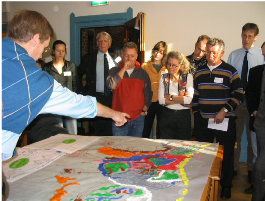
Figure 4 Determining future images with a map and coloured clay.

The workshops generated a long list of possible discontinuities (Aerts et al., 2008:50) and possible implications for water safety in The Netherlands. Based on the evaluation of these discontinuities, the AVV team included the policy option 'elevation' in its analysis. This option and three other policy options were evaluated in the extended Regional Communities and Global Economy WLO scenarios (Aerts et al., 2008:128-134).