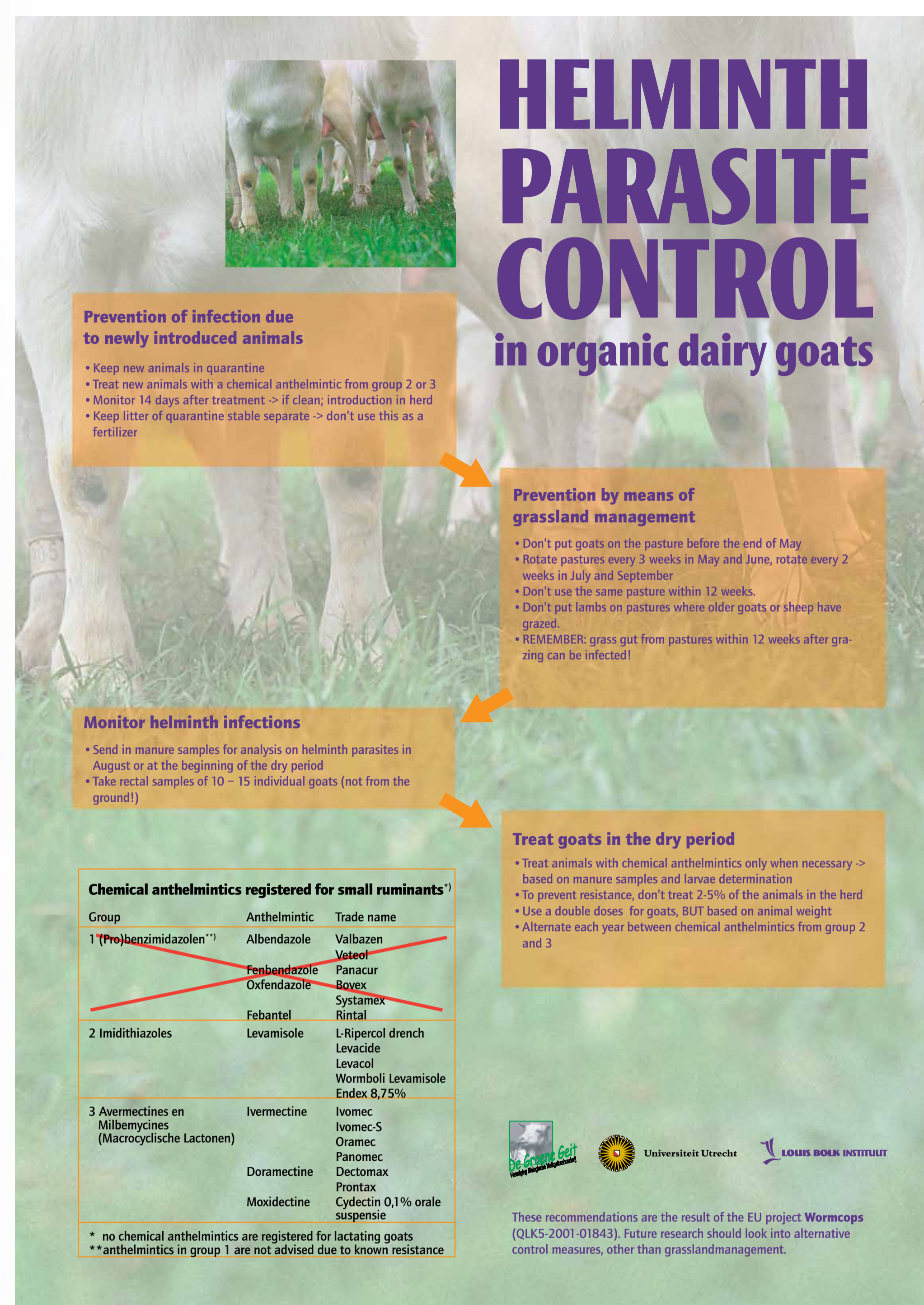
Figure 1: Helminth parasite management tool

Introduction Organic dairy goat farmers in The Netherlands do not wish to use chemical anthelmintics as preventative and curative therapeutics against helminth parasites. Regarding helminth parasites steps are taken in the direction of prevention and monitoring, and only when necessary curative treatment.