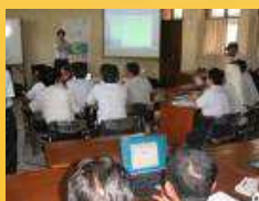
Lectures and discussion with prominent scientists