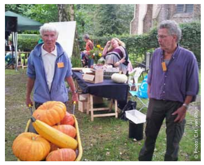
Celebrating the first harvest, city farming initiative De Kapeltuin, Breda.

to deepen understanding of a number of research themes or learning questions, namely: