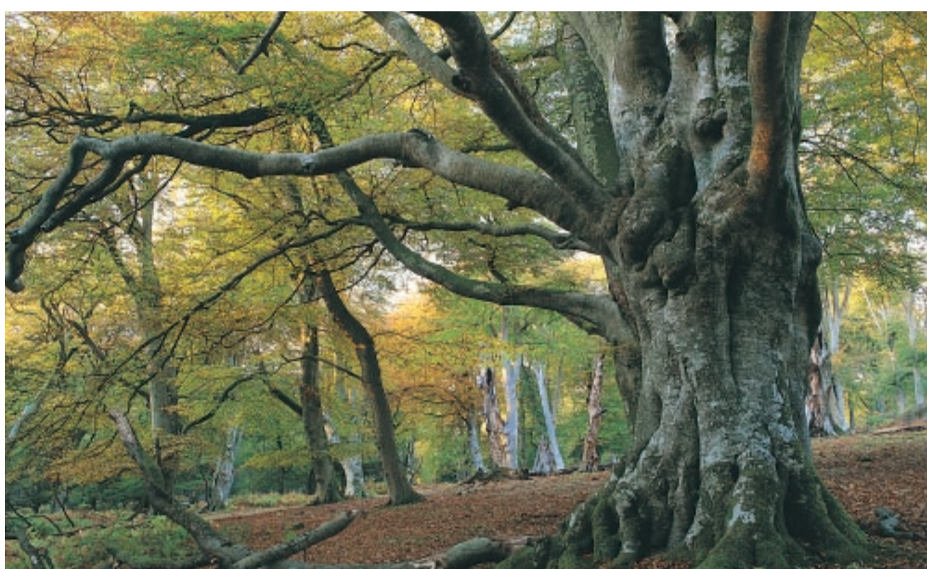
Beech woodland may not survive climate change.

We must take action to allow space for wildlife to adapt to climate change within our land use planning systems.