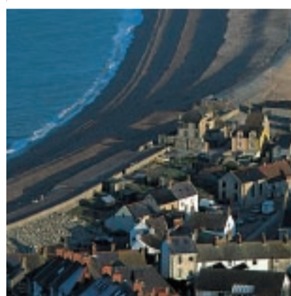
Coastal settlement.

BRANCH brings together spatial planners, policy makers and scientists across North West Europe to: