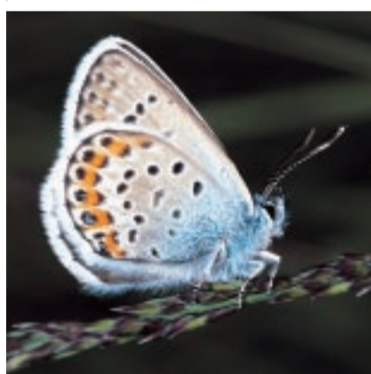
Silver-studded blue, a rare lowland heathland butterfly.