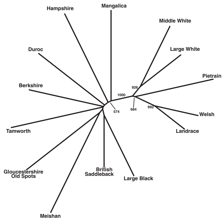
Figure 2 Phylogenetic reconstructions of the British pig breeds using Reynold's genetic distance. Bootstrap support values greater than 50% are indicated.

The results of the BAPS analysis are presented in Figure 3. Given that there are 14 pig breeds sampled in this study, if