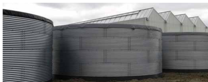
Silos for storage of rain water and test water