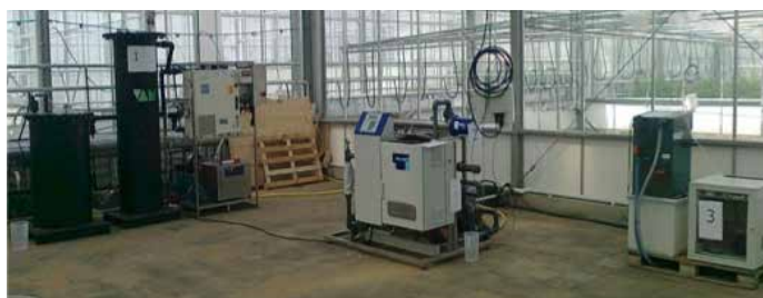
Purification technologies tested at a commercial scale