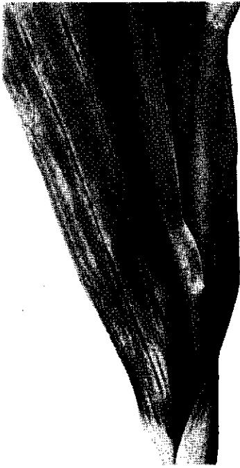
Fig. 1. Watery brown necrotic streaks and lozenge-shaped spots along the main veins near the leaf base of the cultivar 'Lustige Witwe' (syn.: 'Merry Widow').

Fig. 1. Waterige bruin-necrotische strepen en langgerekte ovale vlekken langs de hoofdnerven nabij de basis van een blad van de cultivar 'Lustige Witwe' (syn.: 'Merry Widow').