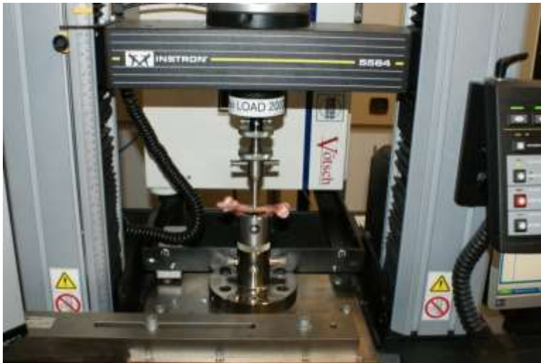
Figure 2. Instron materials tester, model 5564, used for measuring the breaking strength of the tibia.

The strength of the tibia was measured with an Instron Materials tester (model 5564) with automated materials test software (Figure 2). The breaking point was defined as the point at which the resistance of the bone was reduced by 30% or as the bone was bent by 10 mm. The power used to break the bone was registered 9 times/s by the software of the Instron Materials tester. The total breaking strength was expressed in Nmm. The tibia diameter was measured by the material tester Heidenhain. After breaking the tibia, these bones were autoclaved for six hours and grinded, after which a pooled sample of the 5 tibiae per pen were analysed for ash, Ca, P and DM.