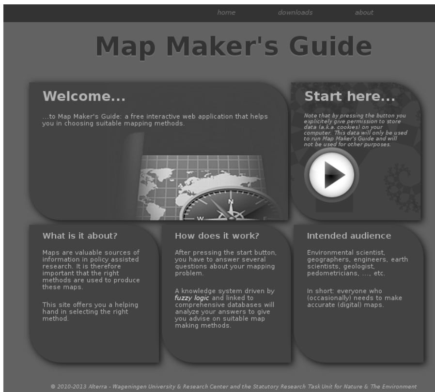
Figure 2.1: Home page of the DSS 'Map Maker's Guide'

Most updates of the website are usually related to its contents only. Think about adding new interpolation methods, adding new background information, or applying corrections and additions to the questionnaire. The style and layout of the website and its engine usually need less maintenance.